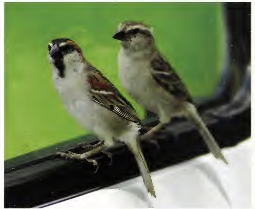
Figures 1–3. Adult male and female Iago Sparrows Passer iagoensis observing their reflections in the windscreens and windows of a car, São Jorge dos Orgãos, Santiago, Cape Verde Islands, October 2009 (R. Barone)

Moineaux du Cap-Vert Passer iagoensis mâle et femelle observant leurs réflexions dans le pare-brise et les vitres d'une voiture, São Jorge dos Orgãos, Santiago, îles du Cap-Vert, octobre 2009 (R. Barone)